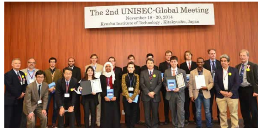
MIC3 finalists and reviewers, Nov 19, 2014, Kitakyushu, Japan